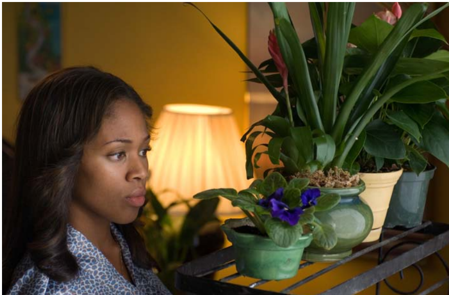
American Violet

Think about American Violet . What were the moments that stood out to you? How did they make you feel? How will they cause you to think about things differently in the future? Share those Truly Moving moments with others at www.TrulyMovingPictures.org . Simply create a membership or login if you already have one and then search the movie list for American Violet . You can leave your review of the movie or thoughts about this Truly Moving Picture in the “Thoughts and Reviews” section.