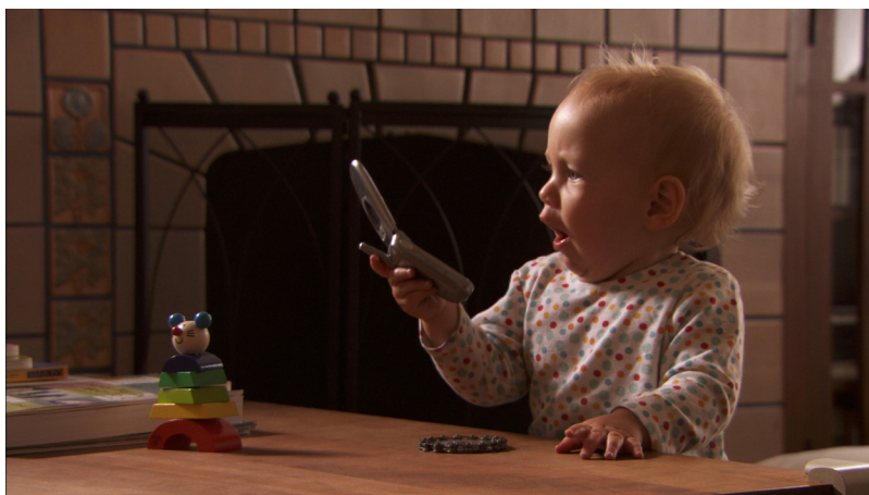
Movie Art © 2010 Focus Features. All Rights Reserved.

If you don't have the money or time to spend volunteering away from your home, consider some projects you can work on from home to make sure newborns are wrapped in love. Take the time to knit caps and booties for infants, as well sew swaddling blankets. There are a number of free tutorials online for these patterns and many hospitals have programs in place to send newborn babies home with something handmade. Do some research to find a hospital to volunteer with in your area.