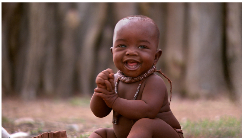
Movie Art © 2010 Focus Features. All Rights Reserved.

Think about Babies . What were the moments that stood out to you? How did they make you feel? How will they cause you to think about things differently in the future? Share those moments with others at www.TrulyMovingPictures.org . Simply login and then search the movie list for Babies . You can leave your review of the movie or thoughts about this Truly Moving Picture Award-winning film in the "Reviews" section.