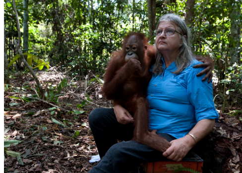
Born to be Wild