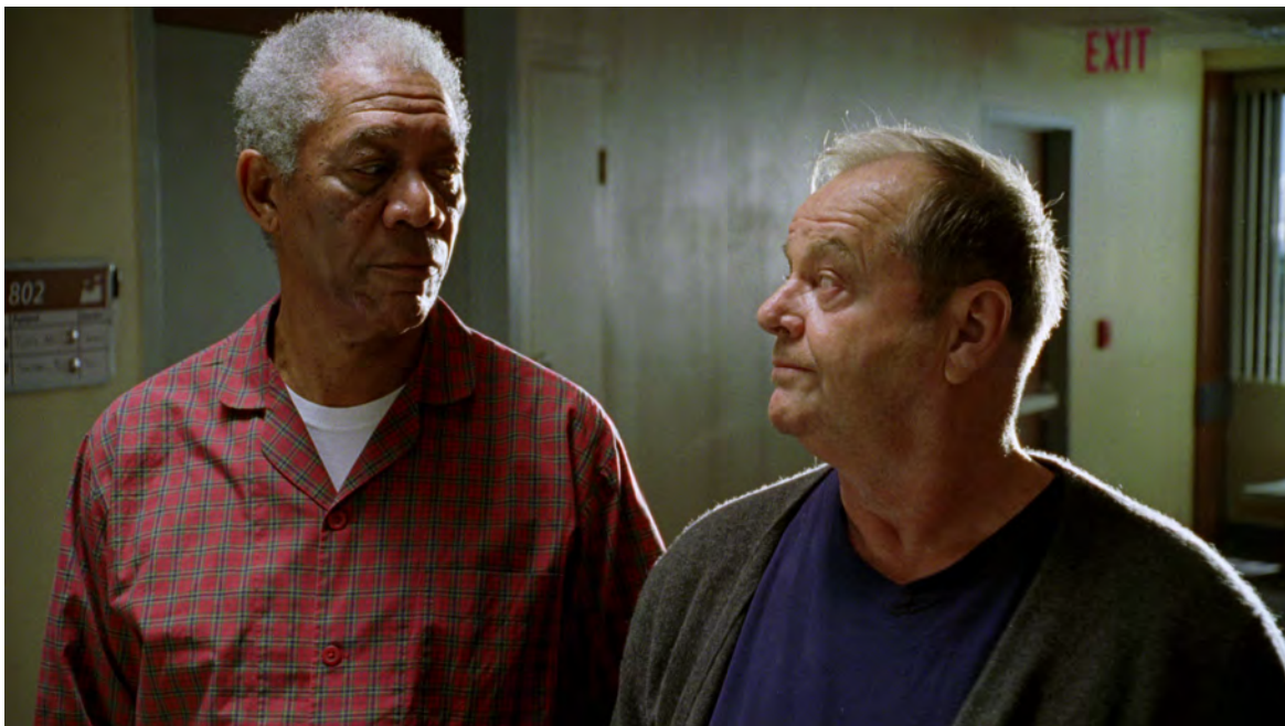
The Bucket List ©2007. All Rights Reserved.

Share these moments with others at www.TrulyMovingPictures.org . Simply create a membership or login if you already have one and then search the movie list for The Bucket List . You can leave your review of the movie or your moving moment in the "Thoughts and Reviews" section.